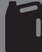
1 GAL. JUG