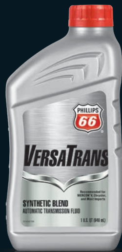
VERSATRANS ATF SYNTHETIC BLEND