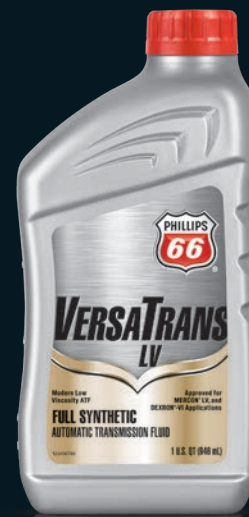
VERSATRANS LV FULL SYNTHETIC