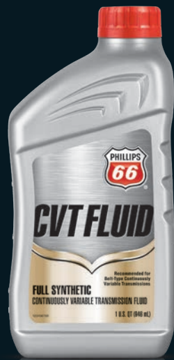
CVT FLUID FULL SYNTHETIC