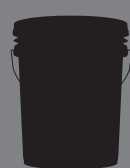
5 GAL. PAIL