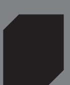
6 GAL. BAG-IN-BOX