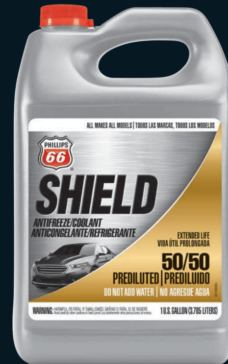
SHIELD® 50/50 PREDILUTED