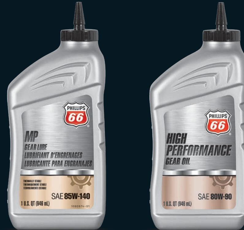
MP GEAR LUBE