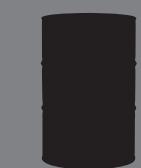
55 GAL. DRUM

Phillips 66® automotive products are available in all mainstream packaging sizes—including our convenient Bag-In-Box display.