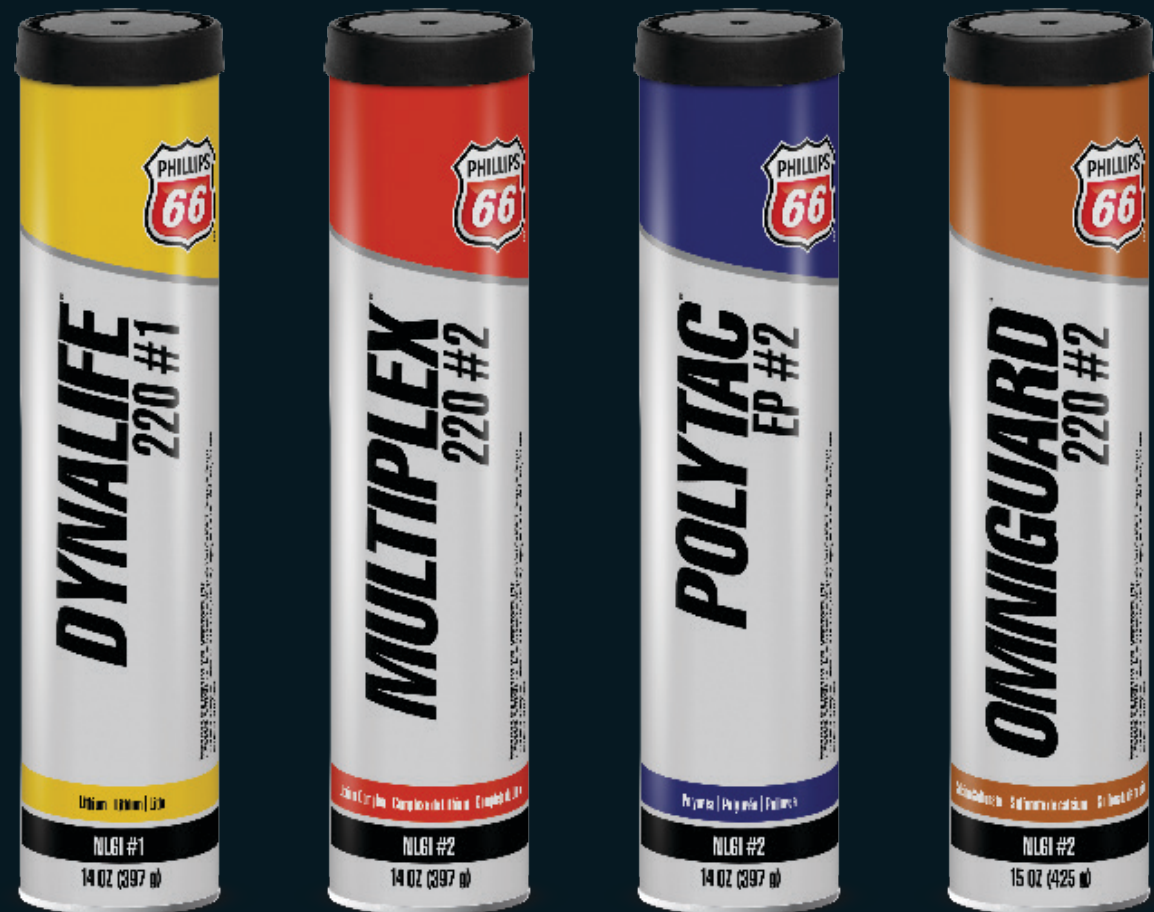
DYNALIFE® 220 NLGI #1