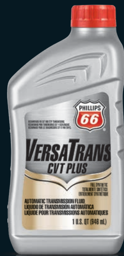
VERSATRANS® CVT PLUS FULL SYNTHETIC